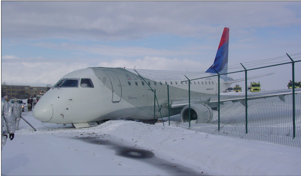
Figure 2. Airplane's Location Southwest of the Extended Runway 28 Centerline