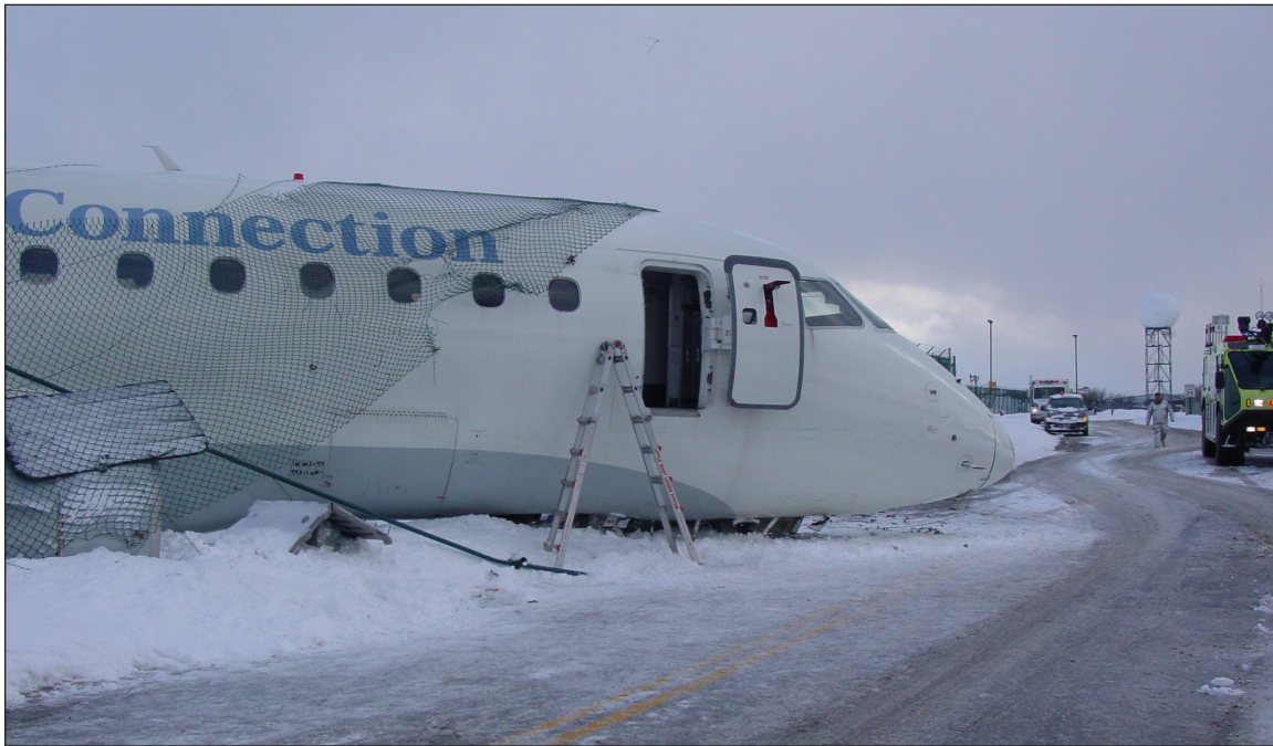
Figure 3. Accident Airplane and Ladder Used for Deplaning

The captain stated that he considered an evacuation but then decided to keep everyone on board until the buses arrived because no one was in imminent danger, ARFF had informed him that the airplane was secure (that is, no fuel leaks or sources of ignition were in the area), and it had been snowing heavily outside. According to the ARFF chief, the flight crew and ARFF personnel agreed that, after shuttle buses arrived on scene, the passengers would deplane and be transported to the ARFF station. The CLE operations log showed that the passengers began deplaning about 1555. ARFF personnel assisted the passengers down the station's A-frame ladder, shown in figure 3, at the right front door (1R) exit. The ARFF chief and a CLE operations supervisor indicated that the ladder was open to its A-frame configuration during the deplaning. The ARFF log showed that passenger deplaning was completed by 1630. The flight attendants and flight crew deplaned afterward using the ladder. They were then transported to the ARFF station in an airport vehicle.